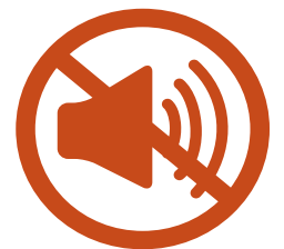
Peace and quiet thanks to the quiet auger system