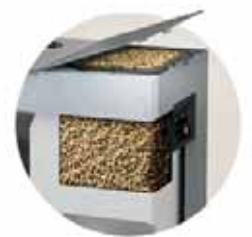
34 kg pellet hopper