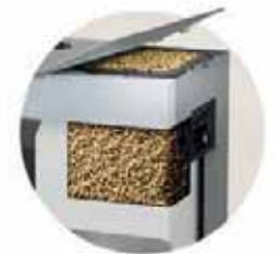
~45kg pellet hopper