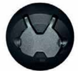
The tipping grate ash removal system empties the combustion cavity automatically and reduces your cleaning work to a minimum.