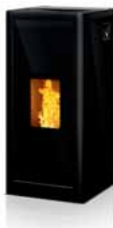
Black decorative glass