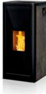
Rust effect - Metallic